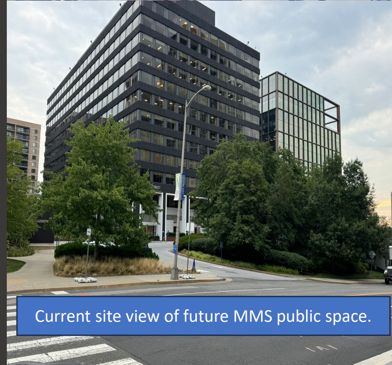
Current site view of future MMS public space.