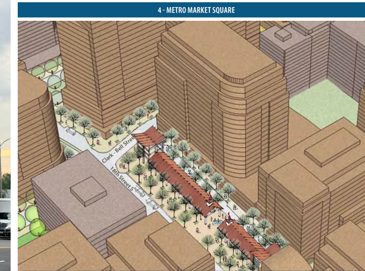
Crystal City Sector Plan (2010) illustrative perspective of the future public space.