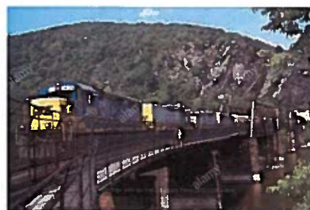
Union Pacific in TN & AR (left), and CSX in WV (right)