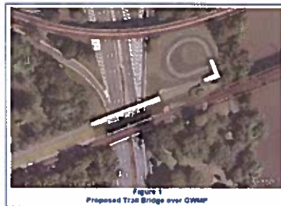
14 th Street Bridge Corridor Draft EIS, Appendix N

FHWA's (Eastern Federal Lands) 14 th St. Bridge Corridor Draft EIS (unadopted) recognized the importance of connecting Long Bridge Park and the Mt. Vernon Trail even without a new river crossing.