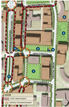
Proposed Plan - Figure 3.3.6

HOWEVER, all along, we have resisted an additional part of the overall package which is totally inappropriate in terms of both substance and process. The existing plans